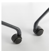
Castors / KB Hard or soft castors.