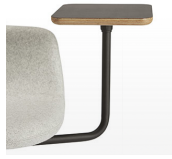
Writing pad / XK