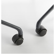
Castors / XK Hard or soft castors.